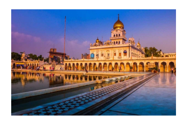
Gurudwara Bangla Sahib